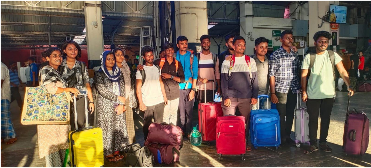
Representing Indian Youth Parliament - September 2022, Jaipur Rajasthan- Team Tamil Nadu